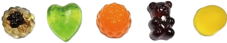
RASPBERRY FILLING SHAPE 3.5g HEART SHAPE 6g RASPBERRY SHAPE 4g BEAR SHAPE 2.5g BULLET SHAPE 3g